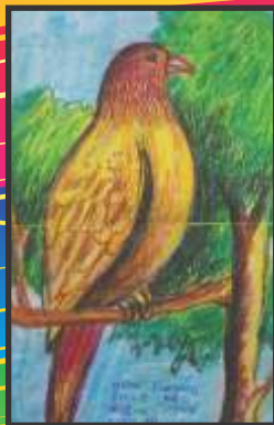
Divyansh Singh - III 'B'