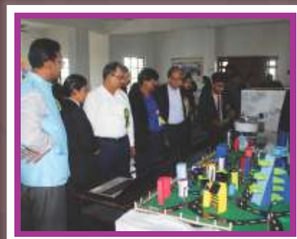
Dignitaries examining the projects