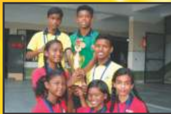
Under 14 Champions at CBSE Cluster Athletics