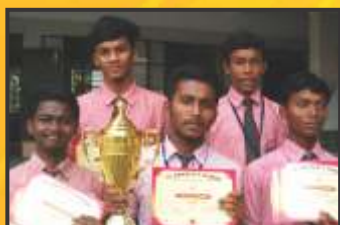
Emerald House , Winners at Inter-House Khokho Tournament Senior Group - Boys.