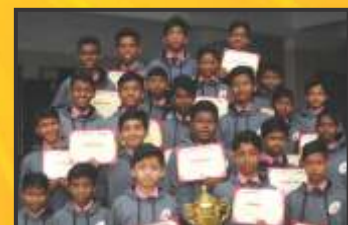
Ruby House , Winners at Inter-House Basketball Tournament Junior Group - Boys.

Optimism is the faith that leads to achievement. Nothing can be done without hope and confidence. — Heller Keller