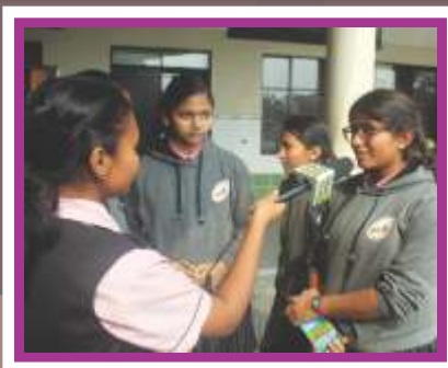
St. Arnold's Media team in action