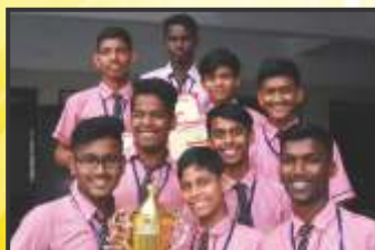
Ruby House , Winners at Inter-House Kabaddi Tournament-Senior Boys.