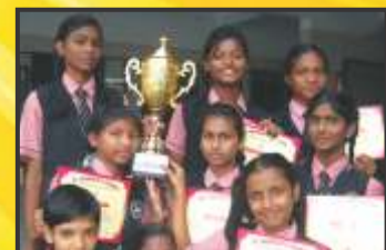
Sapphire House , Winners at Inter-House Khokho Tournament-Girls.