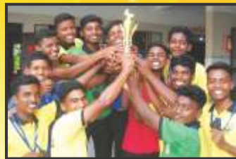
Second Runners-up in Under 14 Football at CBSE Cluster Athletics