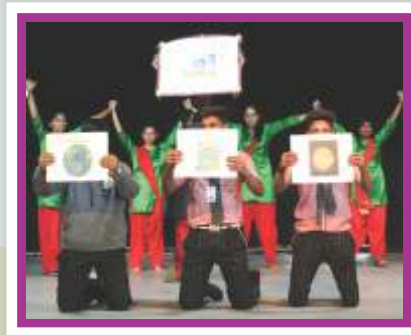
Class X students creating awareness among the visitors through cultural activities.