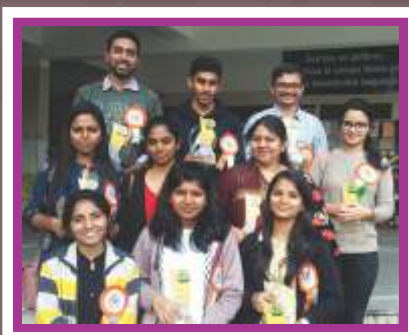
Judges - Research scholars from NIT Rourkela