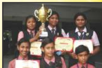
Emerald House , Winners at Inter-House Kabaddi Tournament-Girls.