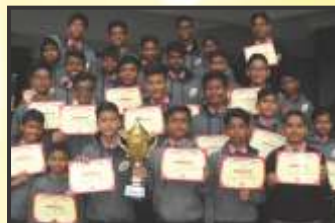
Ruby House , Winners at Inter-House Cricket Tournament-Junior Boys.