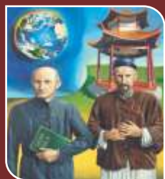
St. Arnold & St. J. Freinandemetz