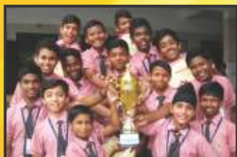
Ruby House , Winners at Inter-House Kabaddi Tournament-Junior Boys.