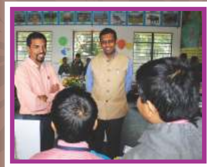
Chief Guest and Principal interacting with the children

To raise new questions, new possibilities, to regard old problems from a new angle, requires creative imagination and marks real advance in science. ~ Albert Einstein