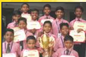
Sapphire House , Winners at Inter-House Khokho Tournament Junior Group - Boys.