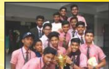
Ruby House , Winners at Inter-House Cricket Tournament-Senior Boys.