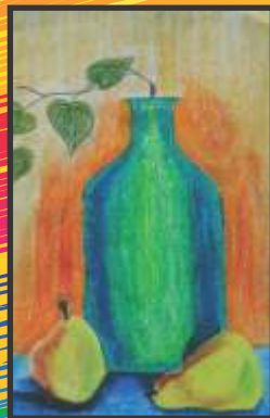
Sweta Singh - VI 'D'