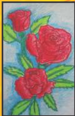
Sai Smruti Praija - I 'C'