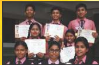
1st Prize in All India Dance Contest Organised by ALCO, Pune.