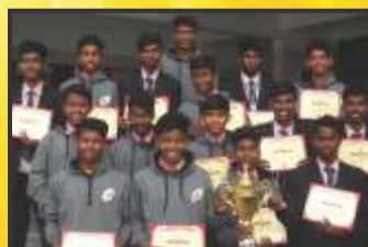
Ruby House , Winners at Inter-House Basketball Tournament Senior Group - Boys.