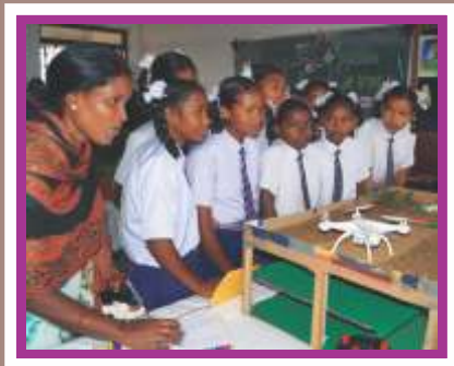
Visitors from other schools